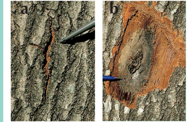
Figure 3. – Fungal mats on oak: (a) crack in bark caused by fungal mat, (b) exposed fungal mat on Spanish oak.

Live oaks tend to grow in large dense groups (called motts) with interconnected roots. The fungus may be transmitted from one tree to another through these root connections. Root transmission is a proven means of spread from one live oak to another. As a result, patches of dead and dying trees (infection centers) are formed. Infection centers among live oaks in Texas