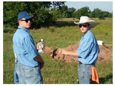
State Soils Judging