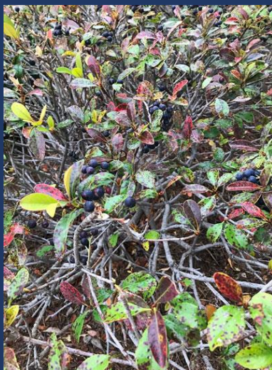
Entomosporium Leaf Spot killing Indian Hawthorn