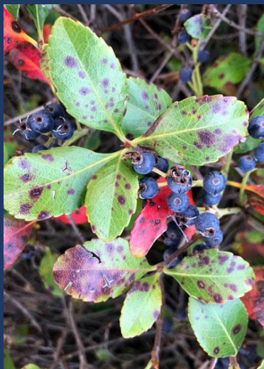
Entomosporium Leaf Spot on Indian Hawthorn Leaves