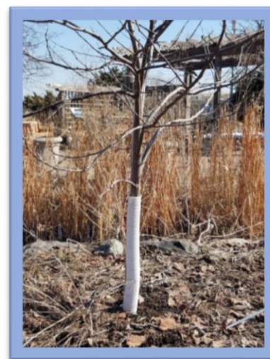
Tree Wrap

Protect the trunk with a commercial tree wrap such as a polyurethane spiral wrap or craft paper wrap. The wrap should be applied in the fall but should be removed prior to trunk expansion each spring. Set a reminder to remove the wrap as it could suffocate the tree if left on too long! In most cases, a tree will only need to be wrapped the first season or two after planting. Tie the wrap firmly, but not tightly. Polyurethane wraps expand without binding the trunk. Start at the ground and wrap up to the first branch slightly overlapping as you go. Do not attach wraps with wire, nylon rope, plastic ties, or electrical tape.