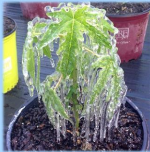
Excessive moisture on leaves and stems will cause severe injuries to plants

Common sense needs to be practiced at this time of year. Do not turn on sprinklers during freezing temperatures. Avoid getting moisture on plant leaves and stems. Ice on walks and drives can create a hazardous situation for you, pedestrians, and even passing vehicles.